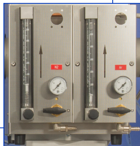
gas supply system